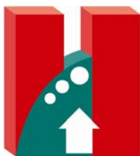
香港房屋經理學會 The Hong Kong Institute of Housing